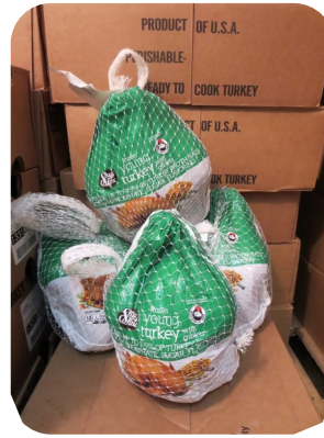
The BRICK provided over 300 Thanksgiving turkeys to families in Ashland and Bayfield Counties