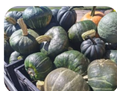
We are deeply grateful to all the growers that contributed a portion of their harvest to us this year!